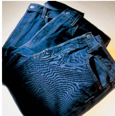
Denim / Jeans