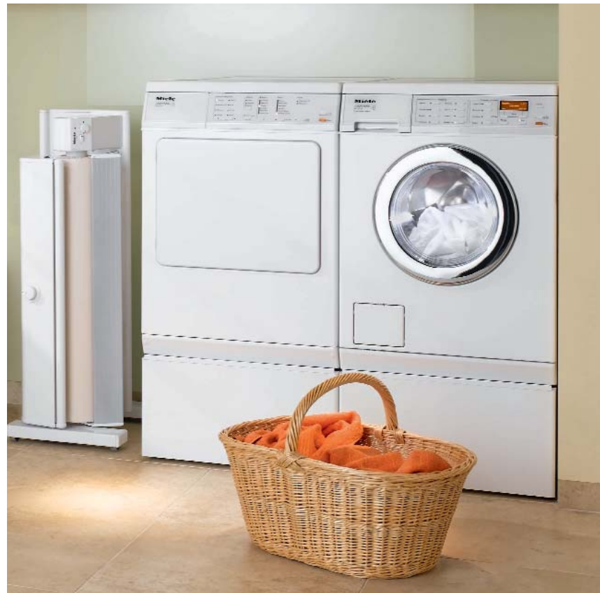
Left photo: Featured is the W 3033 washer, T 8003 dryer with optional stacking kit and B 890 E rotary iron.

feed in the items being ironed. By gently pressing the wide foot control bar, the heater plate contacts the roller that begins to rotate. Your hands are free to guide the laundry smoothly and accurately. The unit is equipped with a special finger guard for increased safety. If, during the ironing process, your fingers come too close to the hotplate, a safety switch will automatically stop the roller rotation and lift the heater plate off the roller. Finished work is carefully deposited on the laundry shelf beneath the roller in even, soft folds. The ample space between the shelf and the roller allows for large items to be pressed.