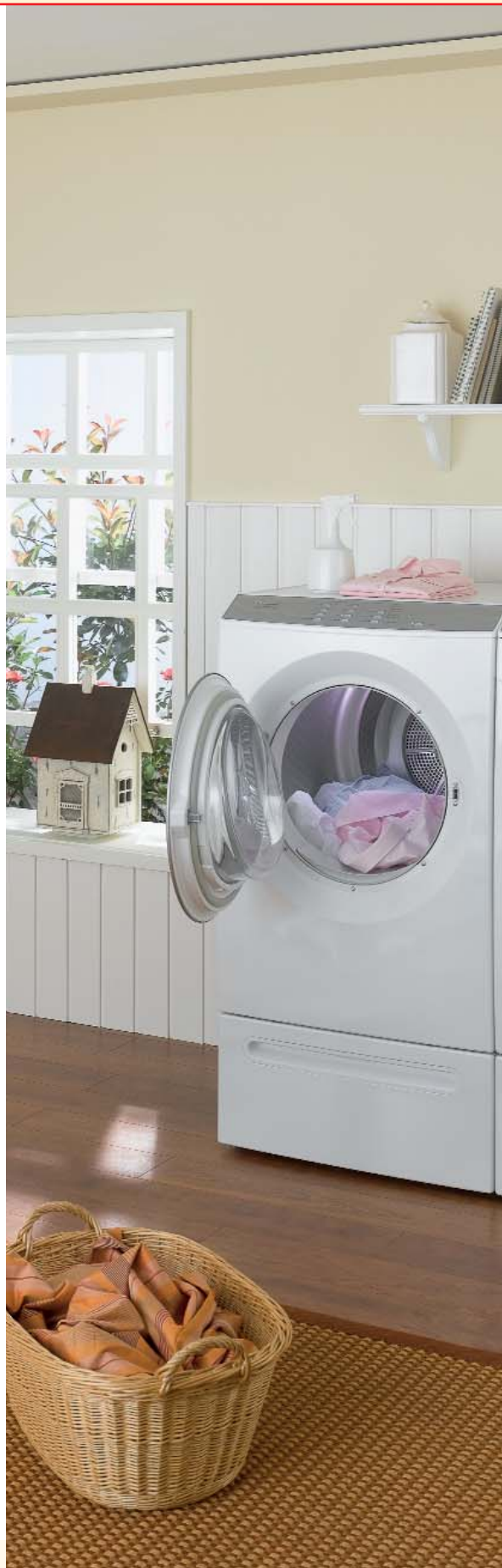
Photo: Featured is the W 4840 washer and T 9800 vented dryer on optional laundry stands.