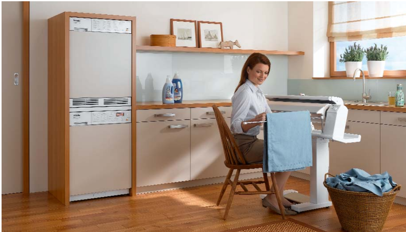
Top photo: Featured is the décor W 3039 i washer and T 8019 Ci dryer. Botton photo: Featured is the décor W 3039 i washer, T 8019 Ci dryer with optional stacking kit and B 890 E rotary iron.